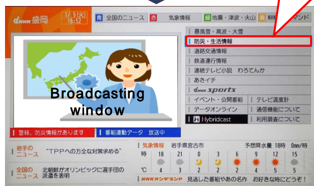
Top menu of NHK data broadcasting

Select 「Disaster prevention and living information」