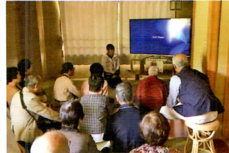
Video presentation of tsunami at Taro Kanko Hotel