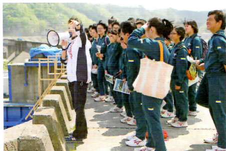
Guidance at the seawall