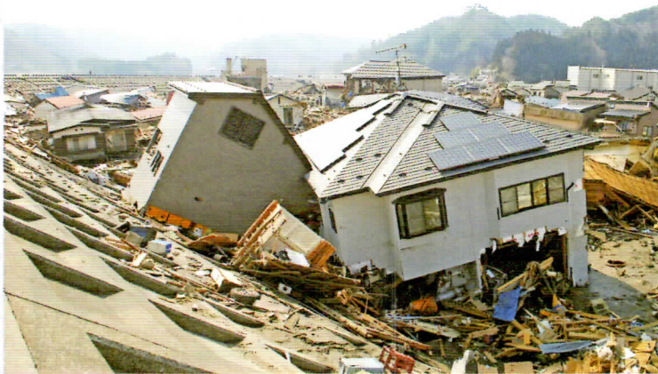
▲ Taro just after the Great East Japan Earthquake

There are some things that can be passed on only by the people in the areas suffered from tsunami damages many times, and each time revived from the damages