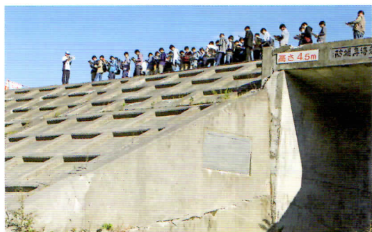
Guidance at the seawall