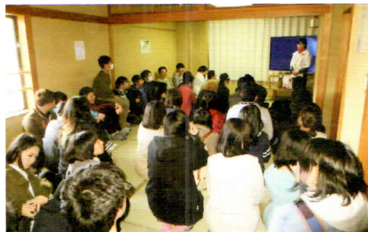
Video presentation of tsunami at Taro Kanko Hotel