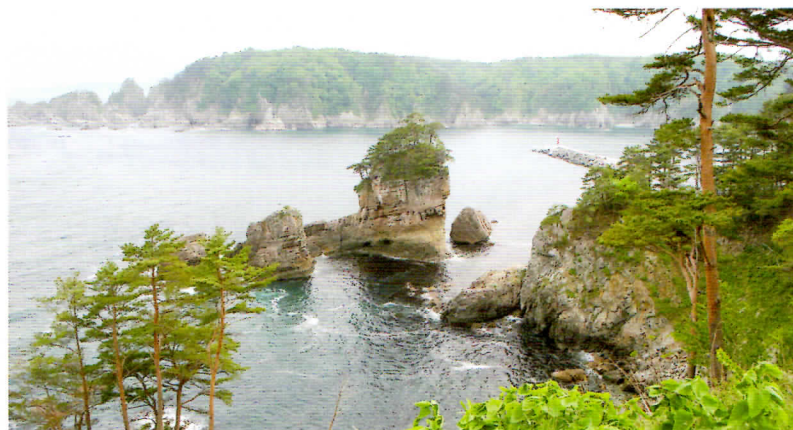
You can enjoy beautiful scenery of Sanno-iwa Rocks, designated as a Geo-point