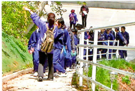
Walking evacuation route