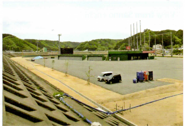
▲ Current state (photographed at the same spot)